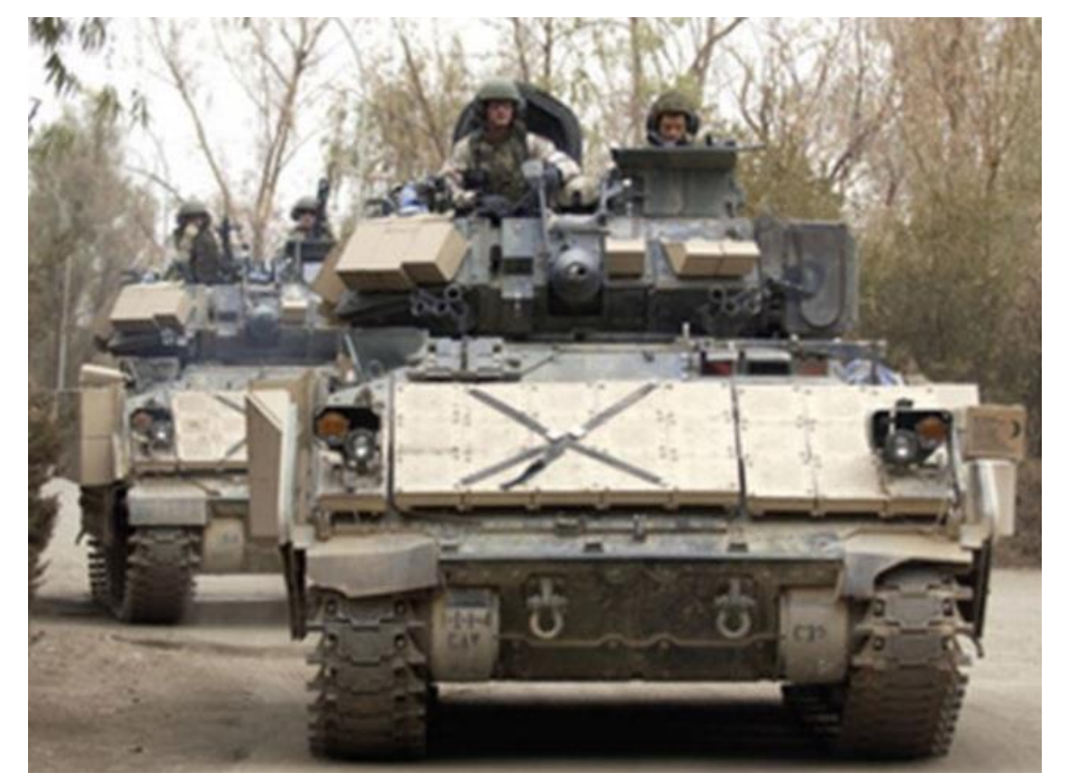
Bradley Fighting Vehicles