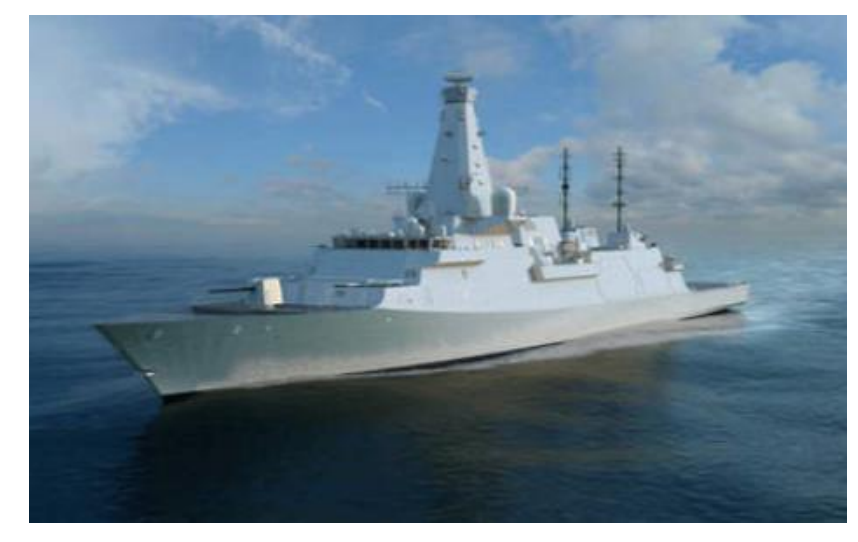
We even build warships