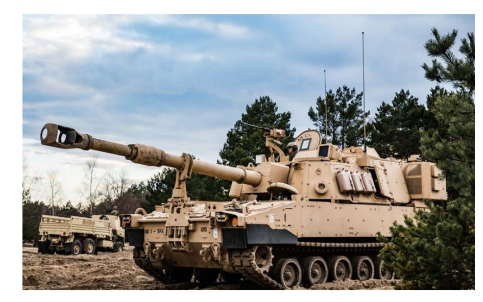
BAE Systems builds armored vehicles

https://www.youtube.com/watch?v=h1PnoPGZCf0