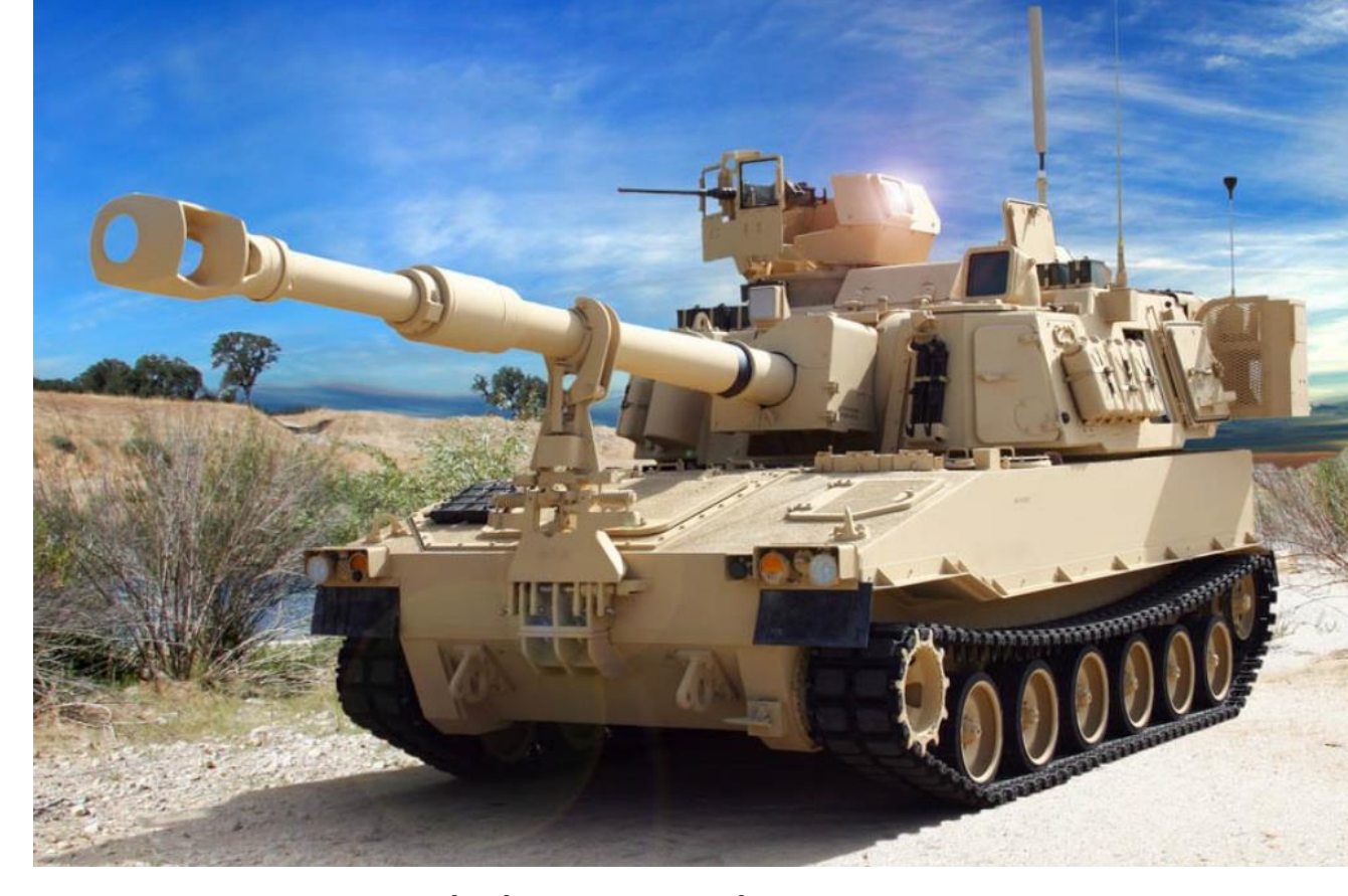
Paladin Armored Howitzer

https://www.youtube.com/watch?v=P1nLoyl6dSI