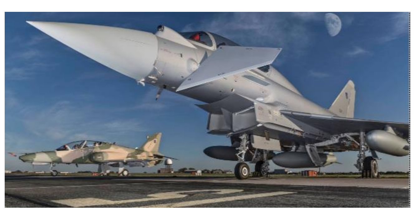
We build aircraft like the Typhoon and Hawk